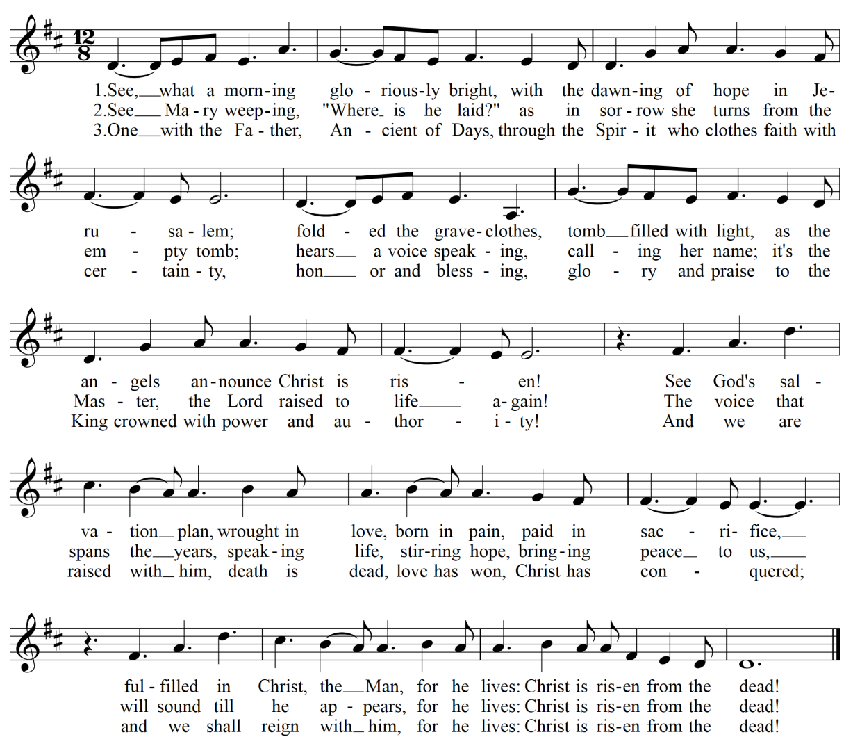
text and music by Keith Getty and Stuart Townend © 2003 Thankyou Music ARR, UBP, CCLI Lic.#152036

* Scripture reading from Mark 15:42-16:8 text printed in the bulletin