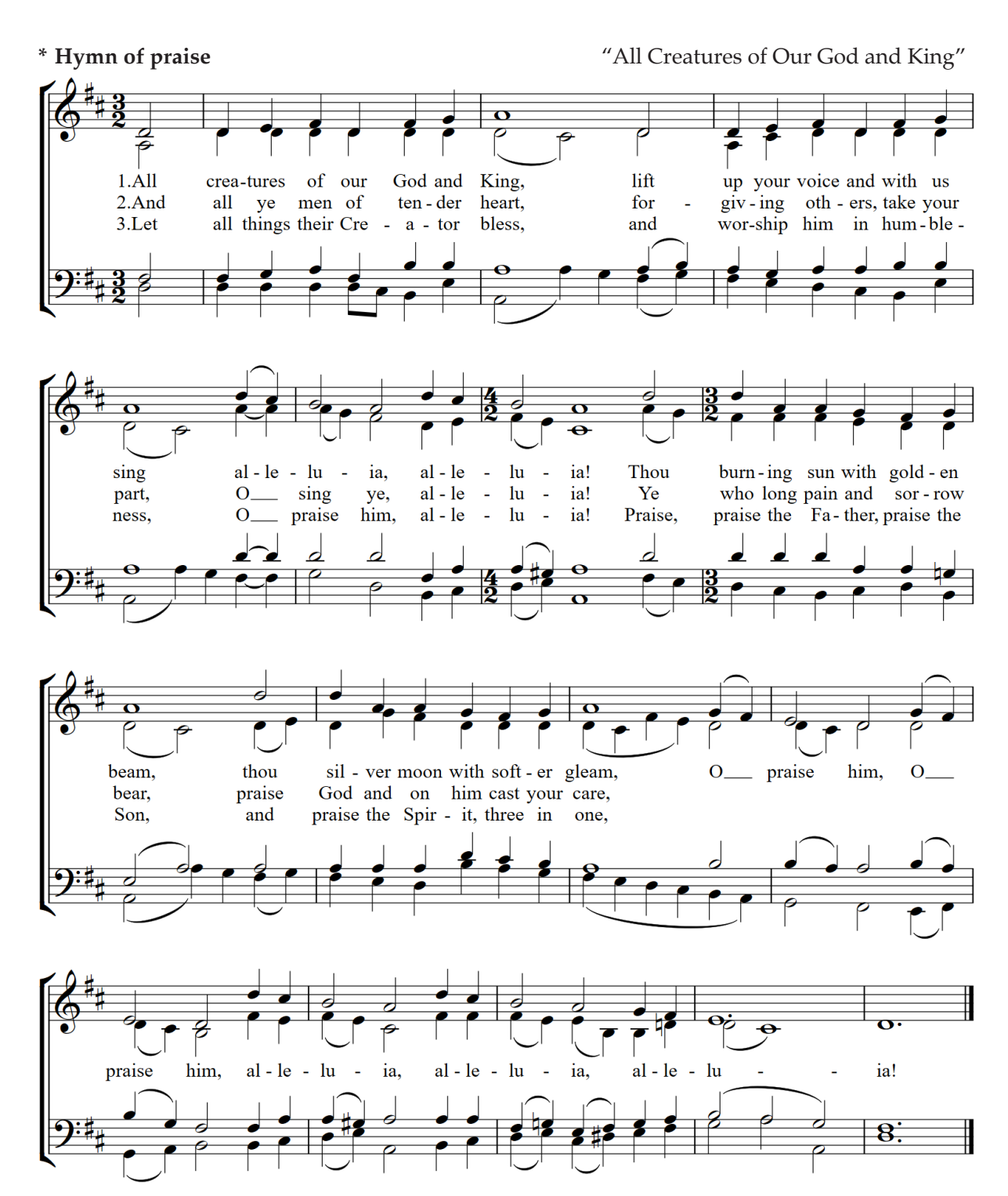
text by Francis of Assisi, 1225; German Tune, 1623, LASST UNS ERFREUEN