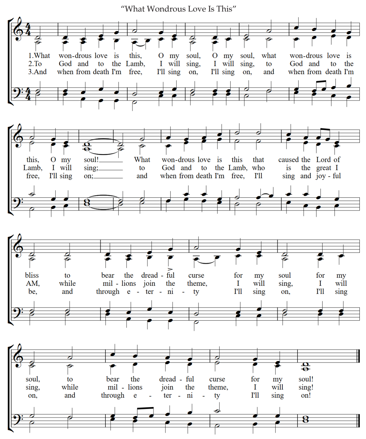
American folk hymn; tune from The Southern Harmony, 1835, WONDROUS LOVE