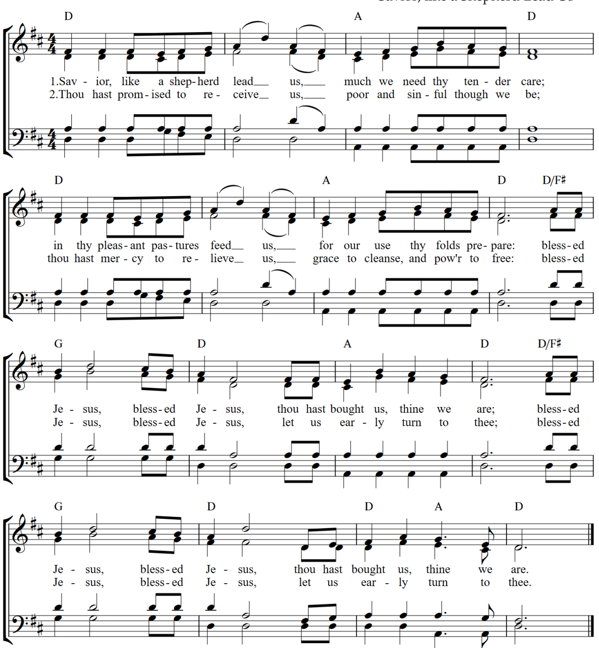
text from Hymns for the Young, attr. to Dorothy Ann Thrupp; music by William B. Bradbury, 1859, Shepherd