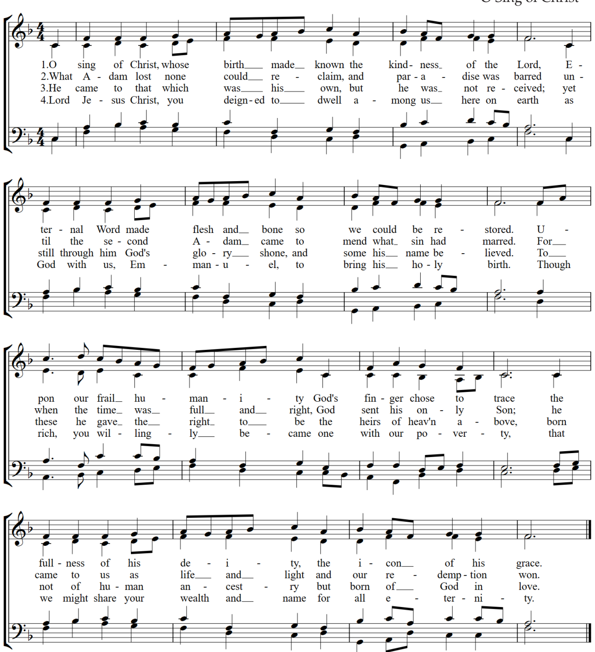
text by Stephen P. Starke, 1996; music is traditional English melody, forest green