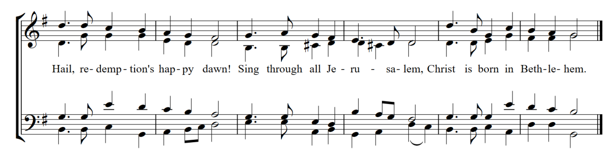
text by Edward Caswall, 1851; music by John Goss, 1870, see AMID THE WINTER'S SNOW