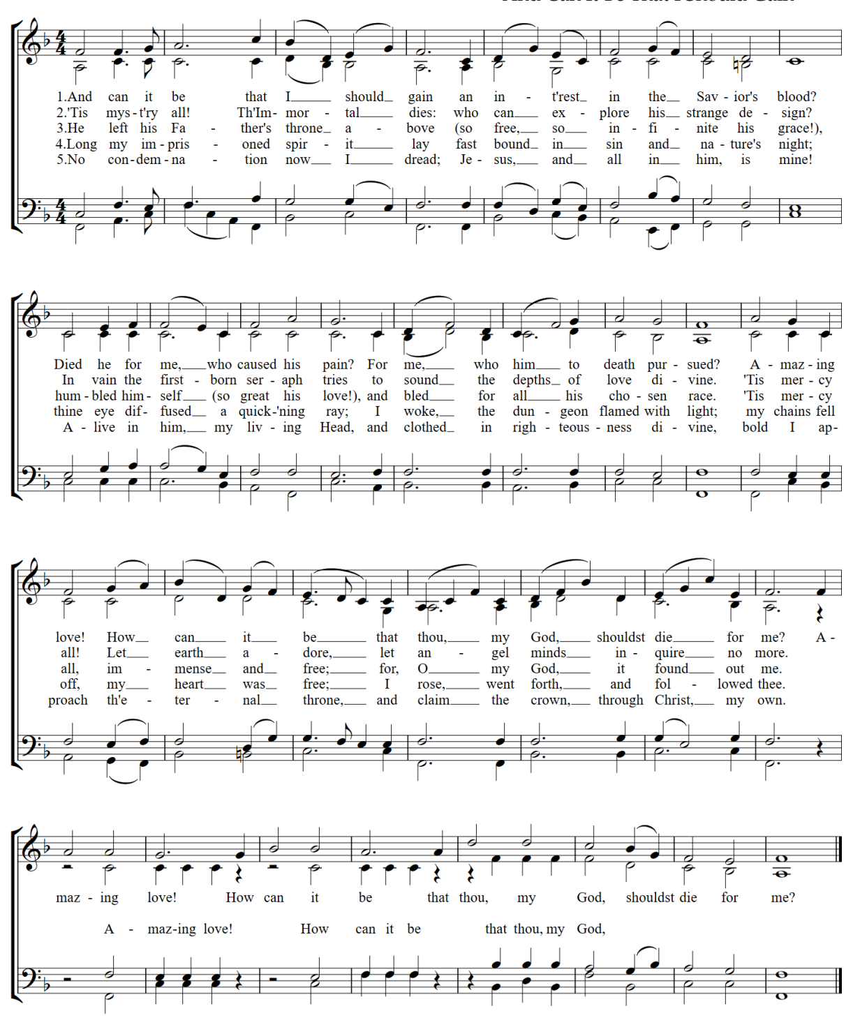
text by Charles Wesley, 1738; music by Thomas Campbell, 1825, SAGINA