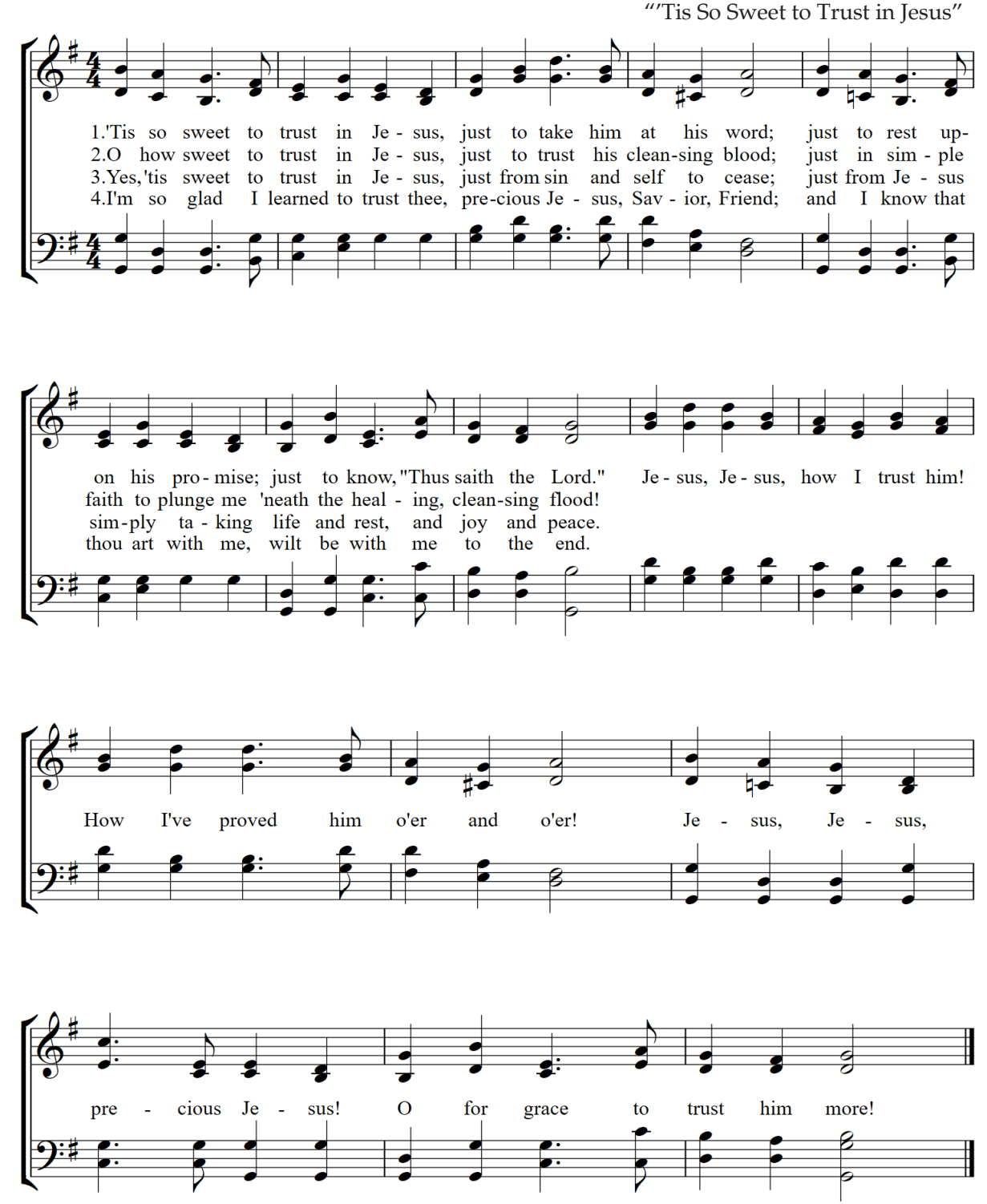
text by Louisa M. R. Stead, 1882; music by William J. Kirkpatrick, 1882, TRUST IN JESUS