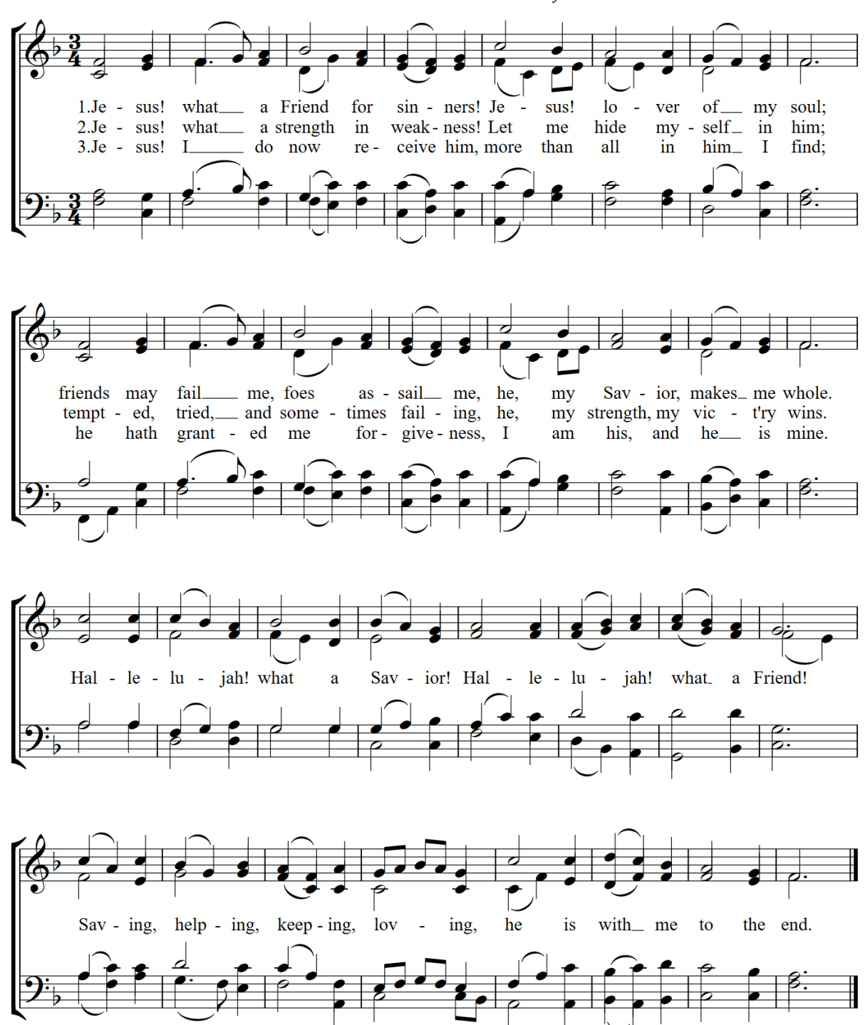
text by J. Wilbur Chapman, 1910; music by Rowland Hugh Pritchard, 1855, HYFRYDOL