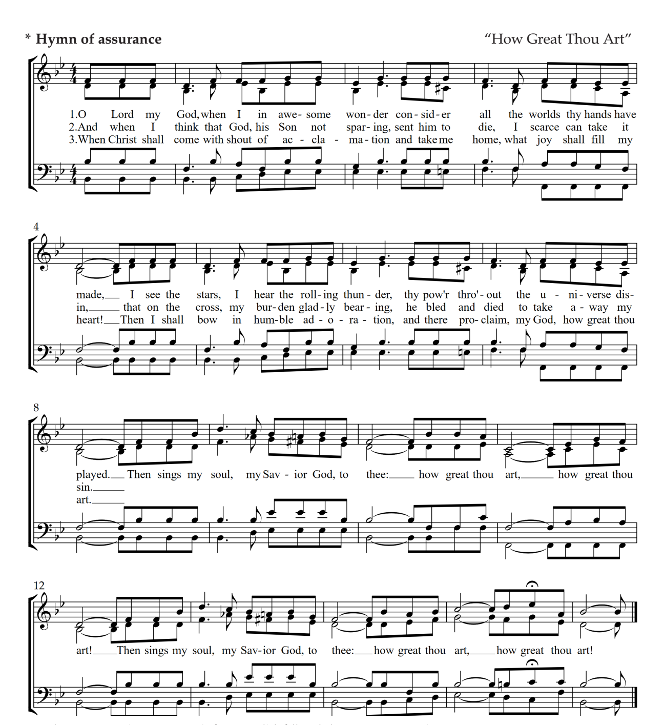
text by Stuart K. Hine, 1949; music from Swedish folk melody, arr. Stuart K. Hine, 1949, o store gud