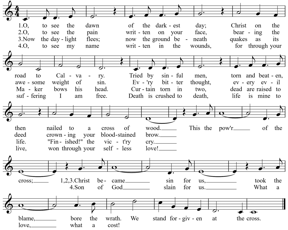
text and music Keith Getty and Stuart Townend © 2007 Thankyou Music ARR, UBP, CCLI Lic.#152036